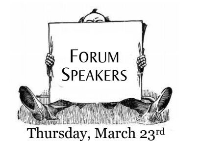
Ballroom C/D from 1 pm to 5 pm