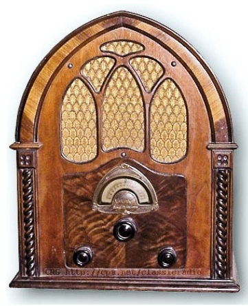
Atwater Kent 82

Also in the auction will be a nearly mint very original Kent model 82 Atwater cathedral. A good friend of mine has asked me to help him sell this radio that was donated to their missionary group. The proceeds will go to help support a school for children in Columbia South children These America. literally have nothing and any money from the sale of this radio will go a long way to helping them attend school. Since this is a charity sale, we will waive the auction fee so every penny goes to the school.